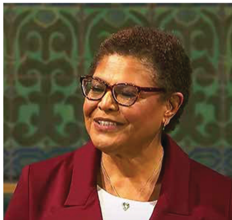
Mayor Bass gives her State of the City address at City Hall.

"We are working to secure long-term interim housing